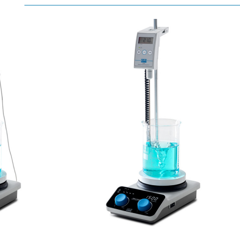
AREX 5 Digital System with VTF and Rod